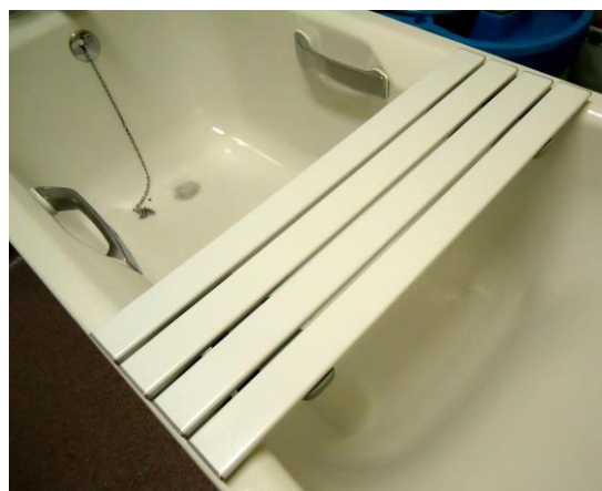
Savannah bath board

You can buy bath boards from other places.