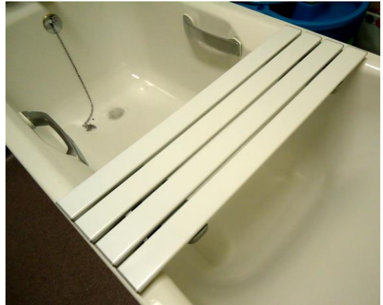
Savanah bath board