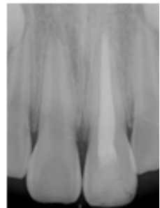
A dental X-ray